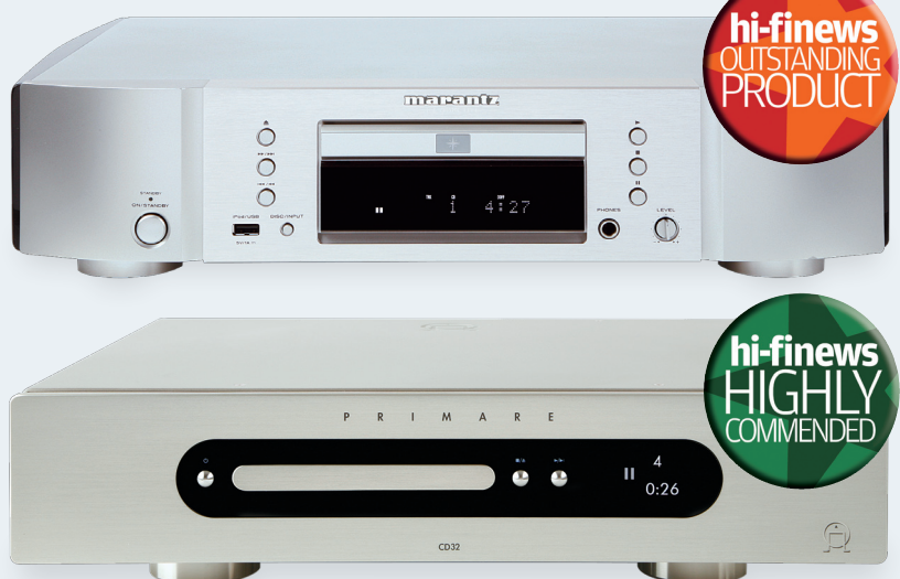
ABOVE: Primare's new CD32 delivers superb transparency, the best in the test group. But if you're looking for value the Marantz SA-KI Pearl Lite is frankly a steal

'You'd need to spend a small fortune to better the CD32'