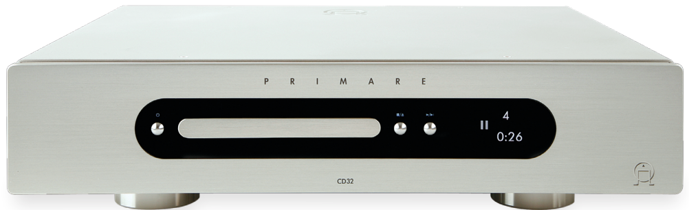
ABOVE: CD navigation is performed via just two buttons on the Primare's fascia. RCU controls the OLED's brightness

The Vivaldi sounded crisp and vivid, the CD32 preserving the fast-edged transients of the instruments and providing an open window through which to observe the musicians spread across the soundstage. While subjectively less sweet than the Marantz SA-KI Pearl Lite and a bit more forward-sounding, it delivered