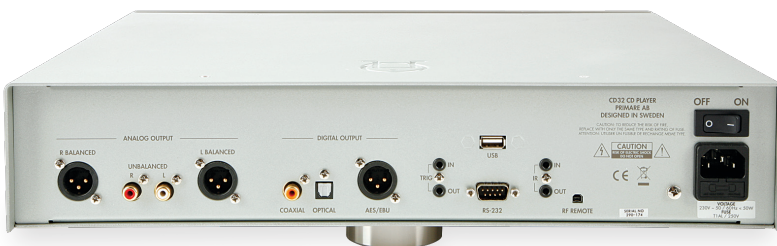
ABOVE: Outputs are single-ended and balanced, there are 3 digital outs, and RS232, IR and triggers are included too. USB input offers only MP3 and WMA file playback